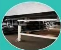
Adjustable beam leg