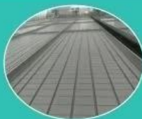
Ebb and flow tray