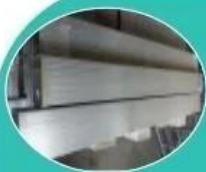
Aluminum alloy frame