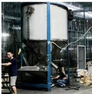
RAW MATERIALS PROCESSING