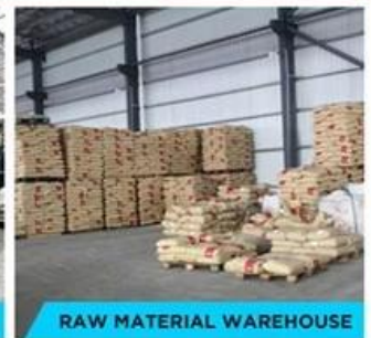
RAW MATERIAL WAREHOUSE